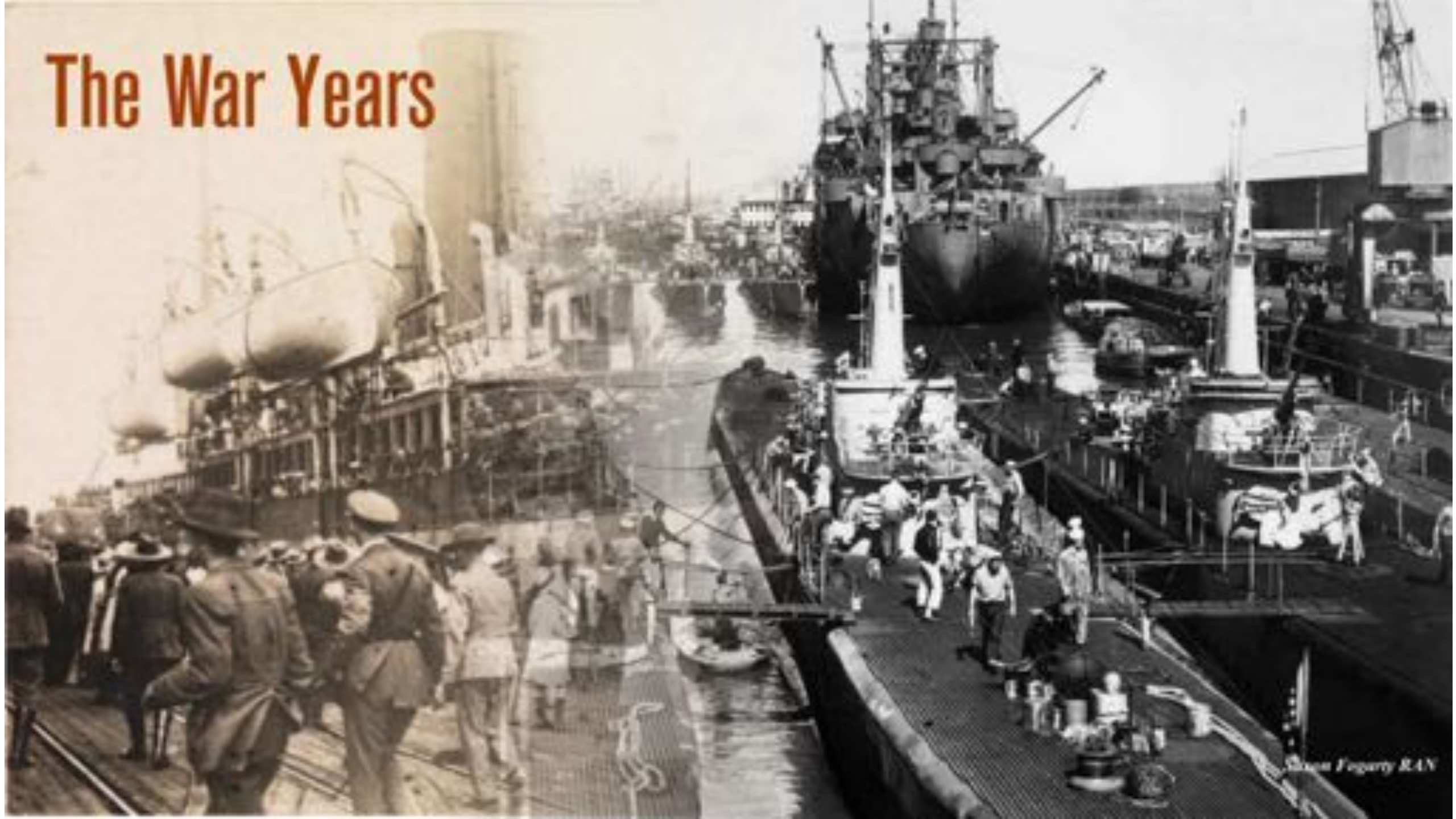
Sixen Fogarty RAN