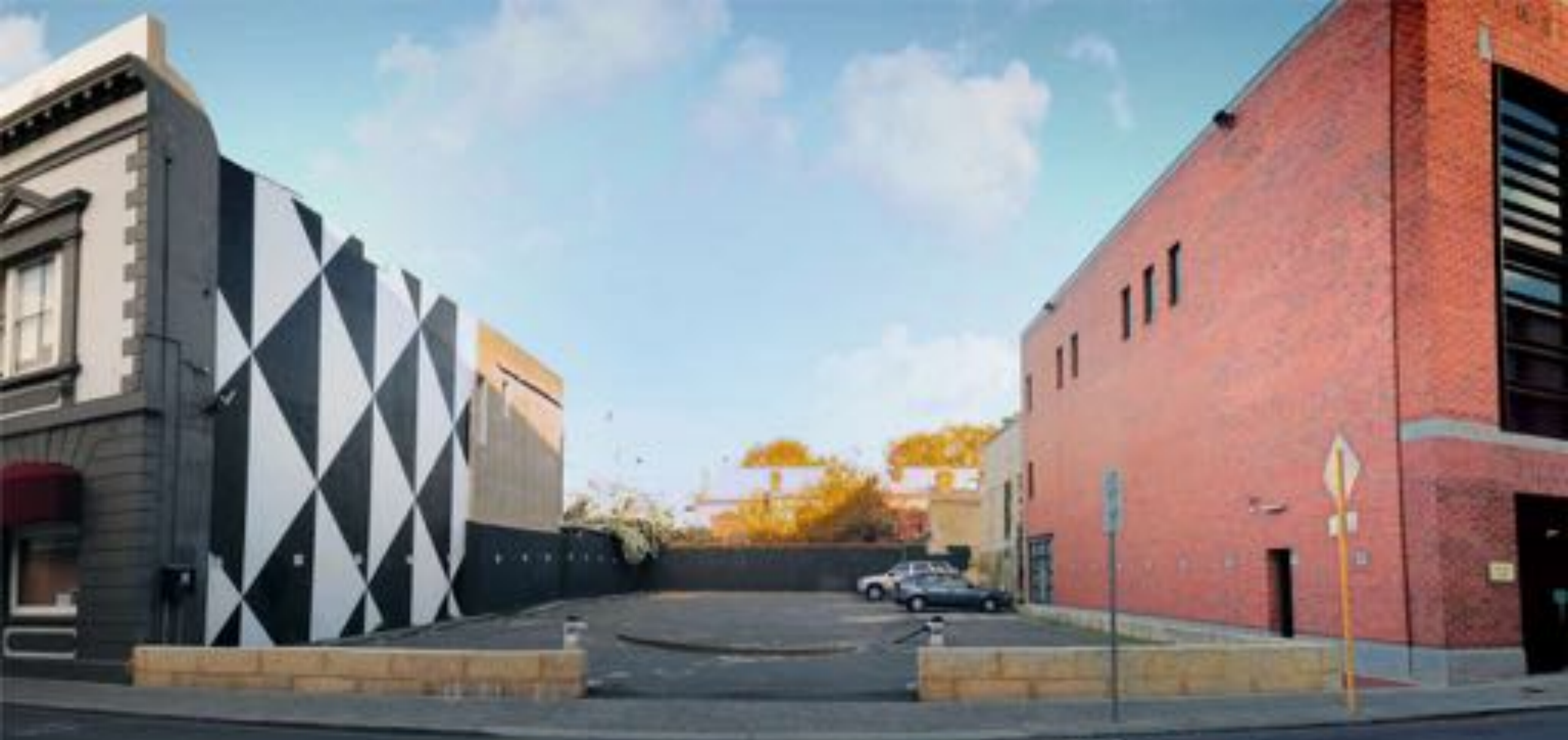
Lodges Hotel - Original Club Site