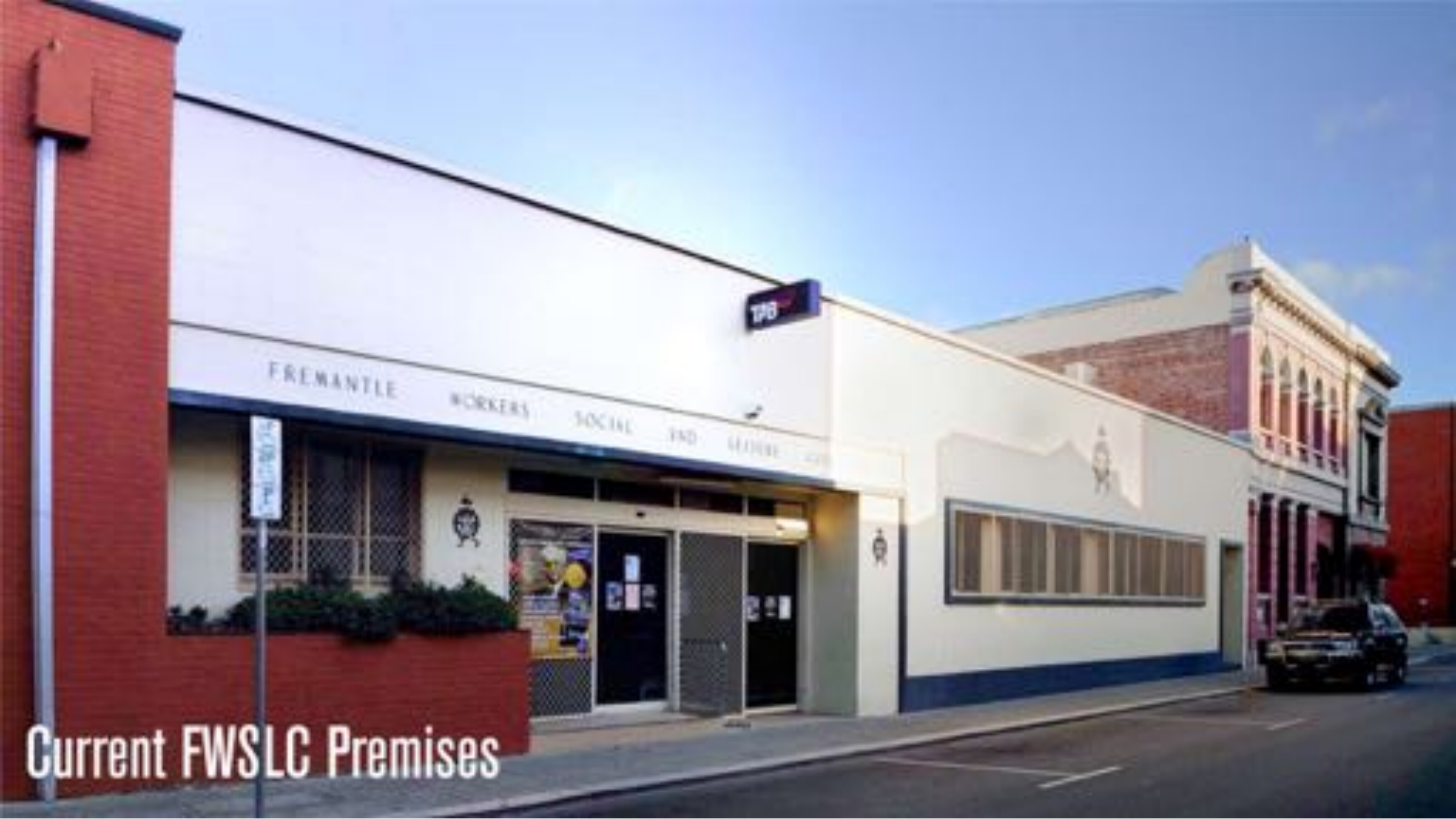
Current FWSLC Premises